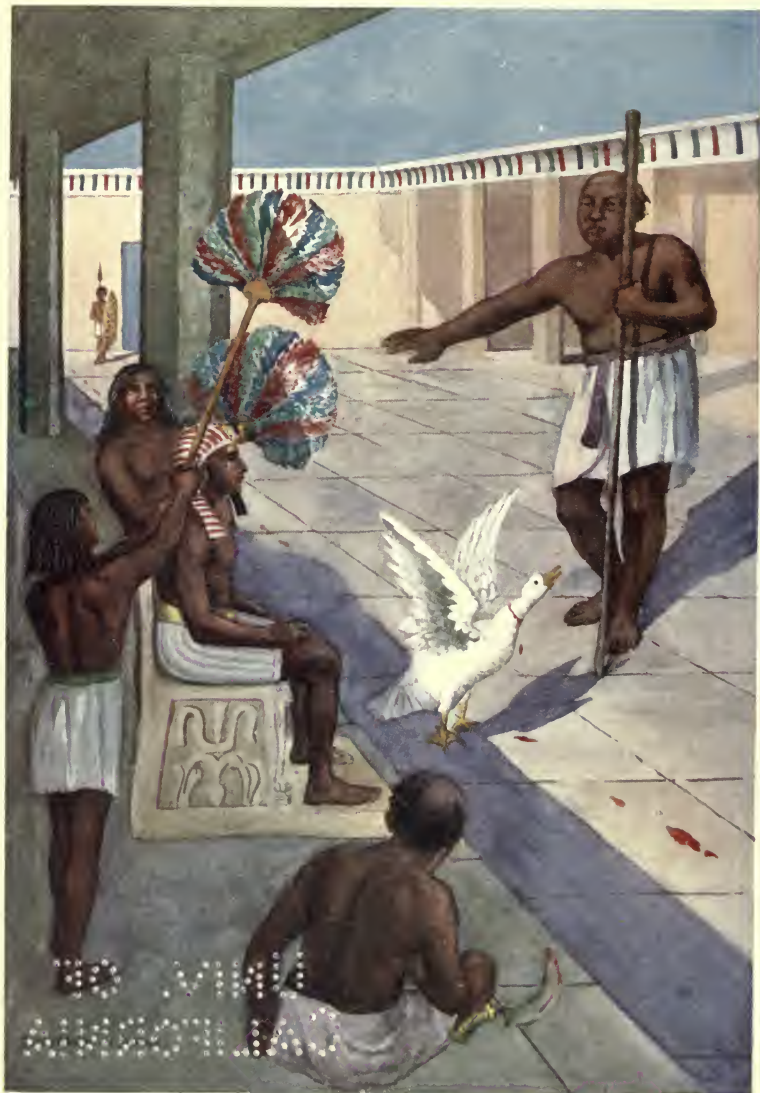
"AND THE GOOSE STOOD UP AND CACKLED."