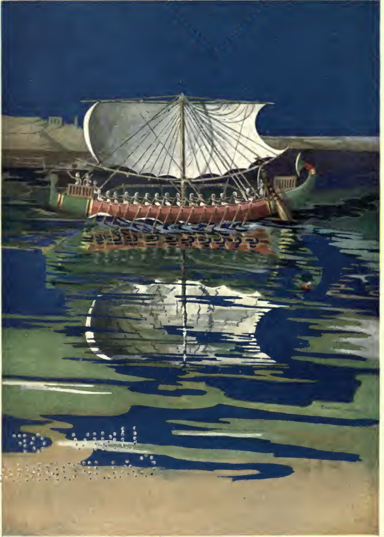
AN EGYPTIAN GALLEY.