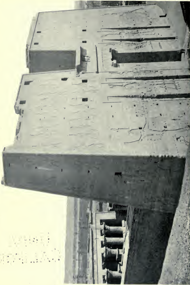
GATEWAY OF THE TEMPLE OF EDFU. Plates 74, 75