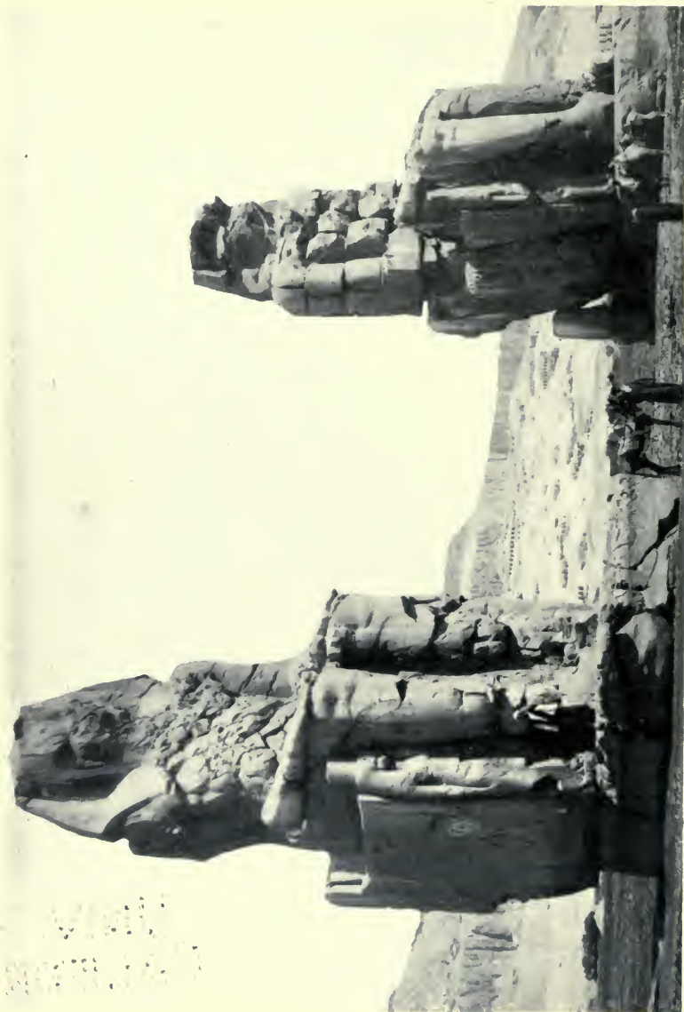
STATUES OF KING AMENHOTEP III. Pages 75, 79

Note the doors of tombs in the cliffs behind.