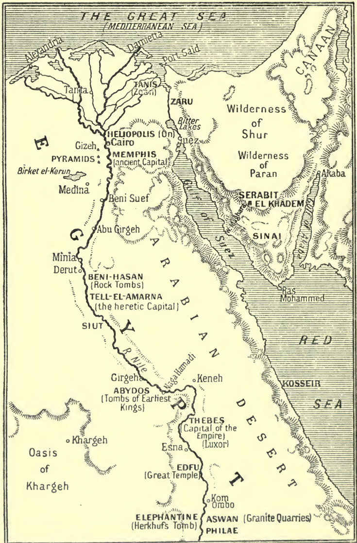
SKETCH-MAP OF ANCIENT EGYPT.