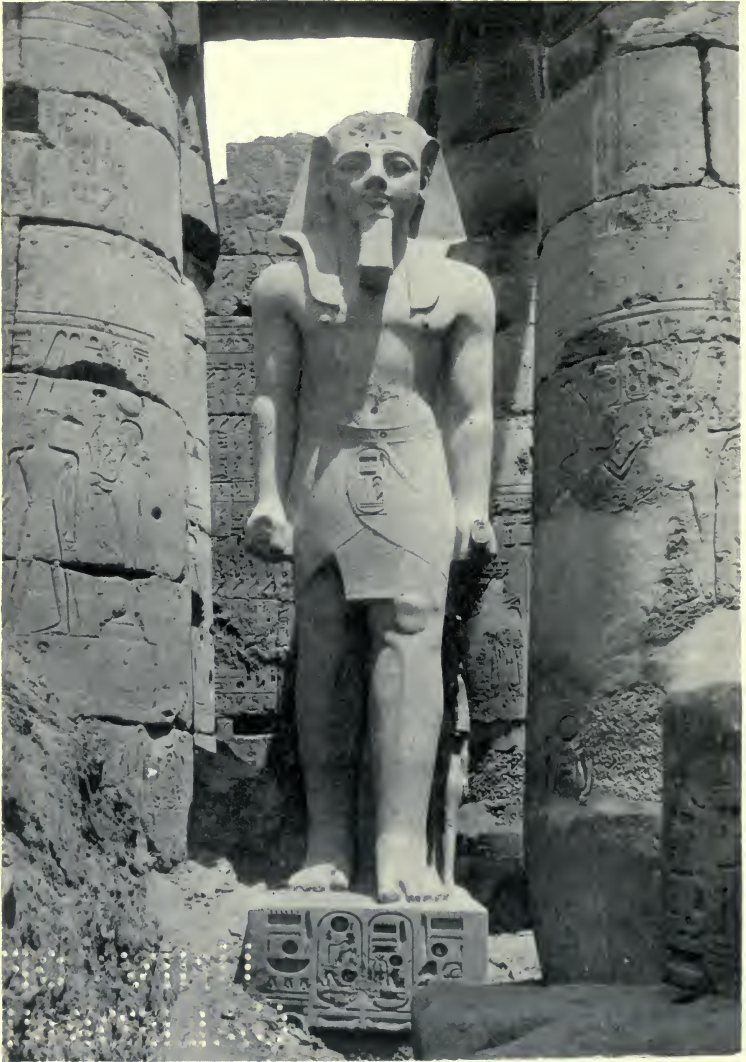
GRANITE STATUE OF RAMSES II. Page 75 Note the hieroglyphics on base of statue. Pages 68, 69 Univ Calif - Digitized by Microsoft ®