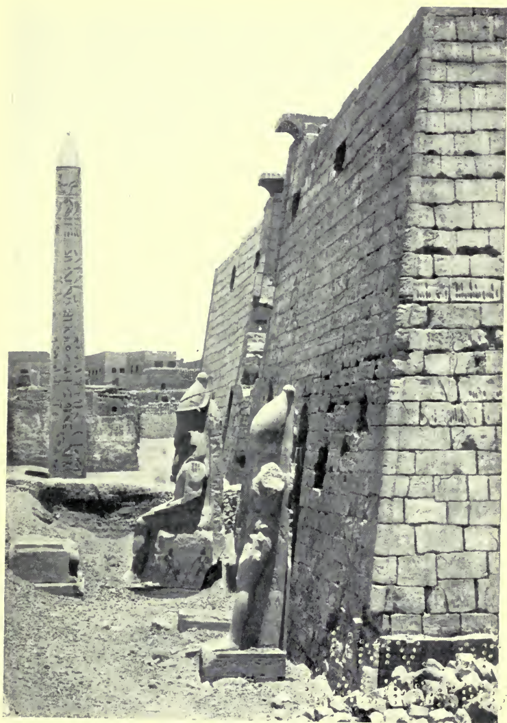
THE GREAT GATE OF THE TEMPLE OF LUXOR, WITH OBELISK. Pages 74, 75