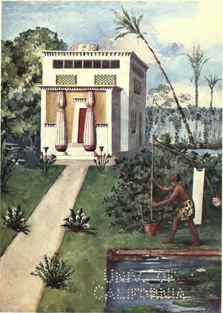
AN EGYPTIAN COUNTRY HOUSE.