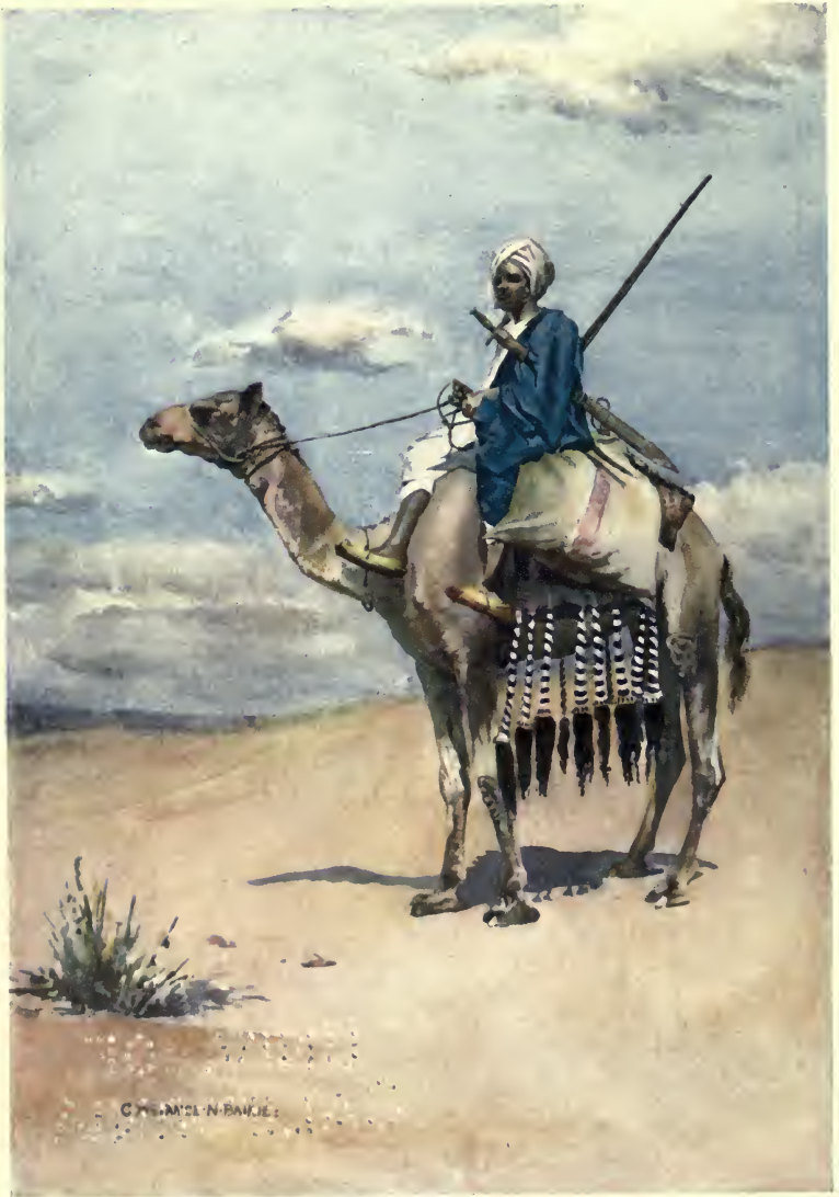
A DESERT POSTMAN.