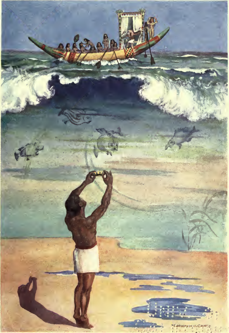
ZAZAMANKH AND THE LOST CORONET.