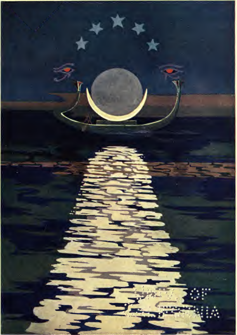
THE BARK OF THE MOON, GUARDED BY THE DIVINE EYES.