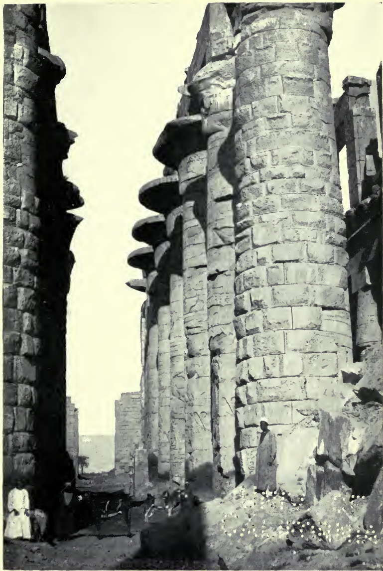
NAVE OF THE TEMPLE AT KARNAK. Pages 75, 76 Univ Calif - Digitized by Microsoft ®