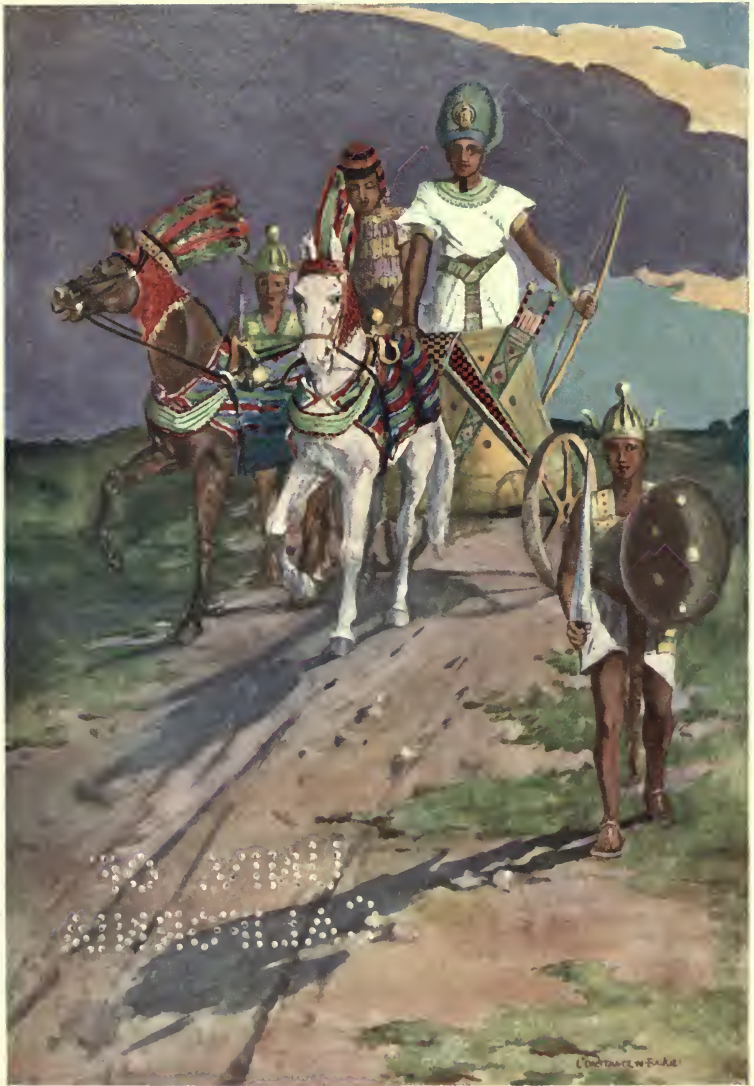
RAMSES II. IN HIS WAR CHARIOT : SARDINIAN GUARDSMEN ON FOOT.