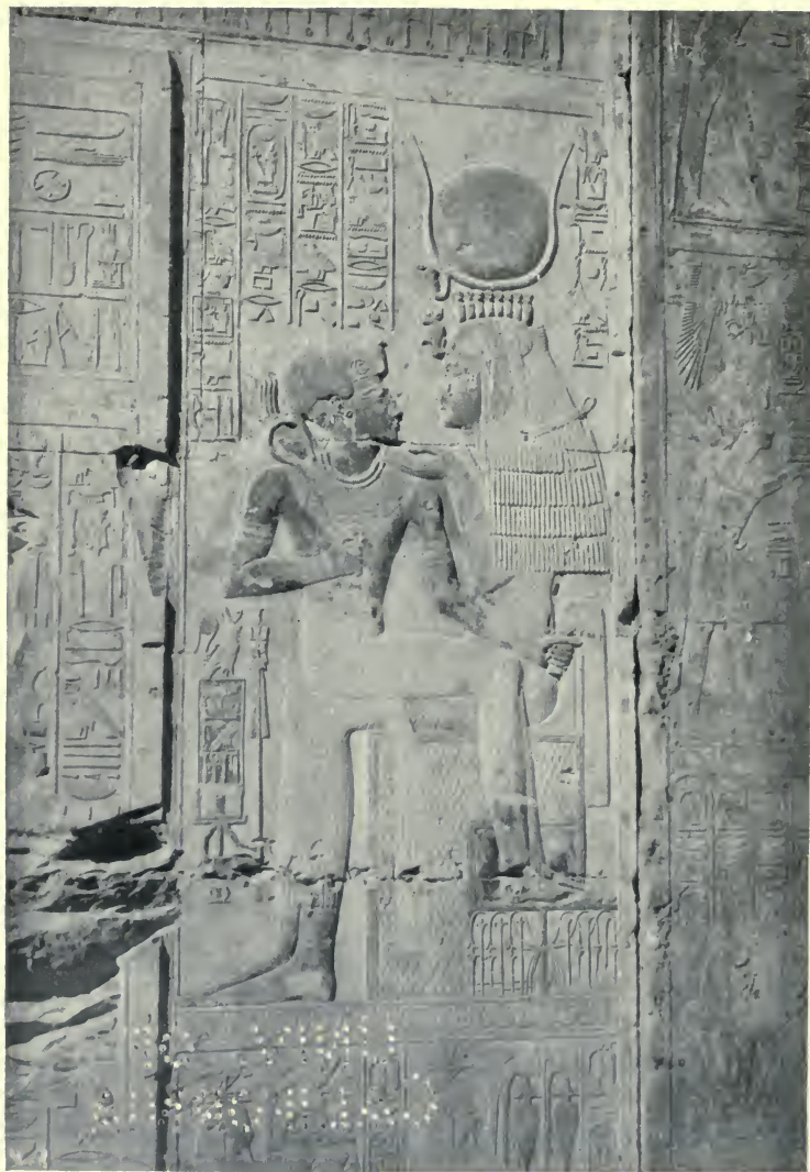
THE GODDESS ISIS DANDLING THE RING. Page 18